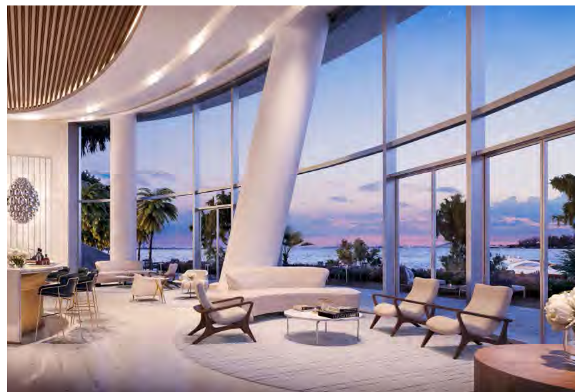
The private owners' lounge, adjacent to the lobby, features a double height bank of windows with sweeping views of the water and the private gardens.