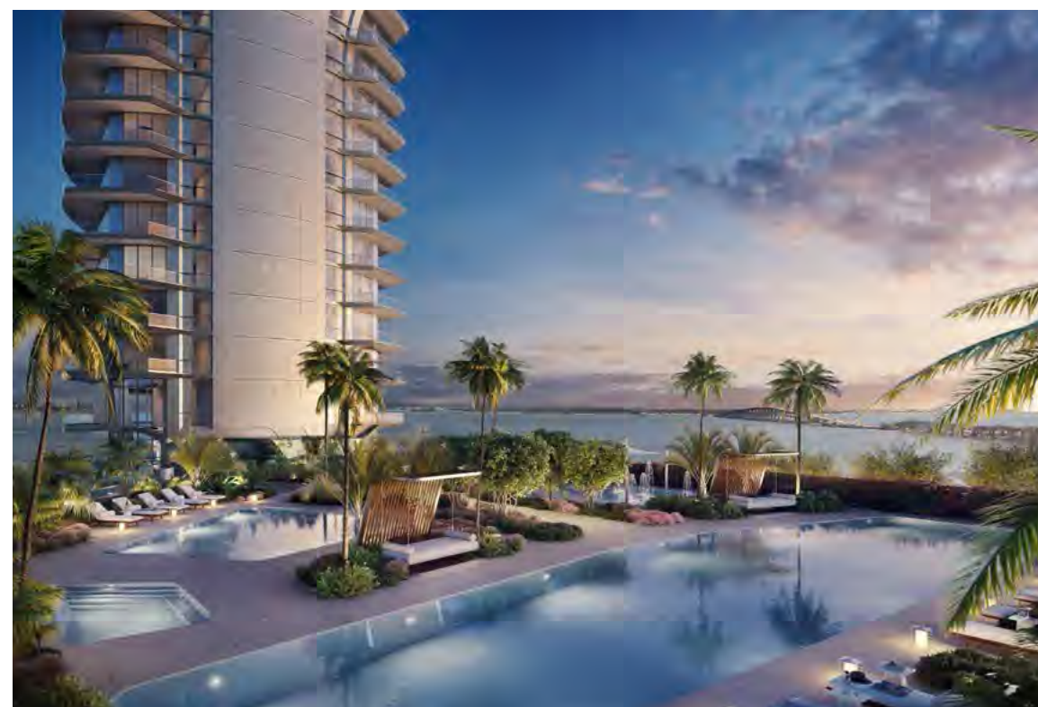
A unique oasis, the third-floor pool deck offers a lap pool, family pool and a children's play area, along with cabanas and outdoor bars.